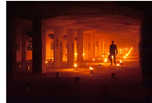
Firemen Biennale Maastricht, 2011