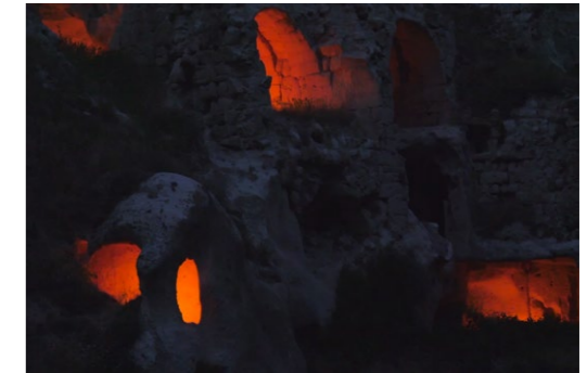
Hidden Worlds Cappadox Contemporary Art, Turkey 2018