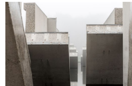
Deltawerk // Land Art Collection Flevoland, 2018