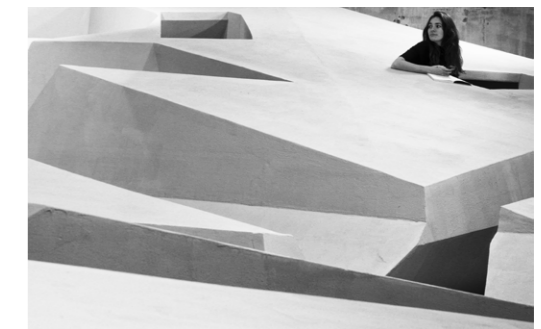
The End of Sitting Gallery Looiersgracht 60, 2014