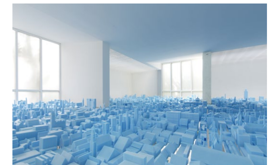
Vacant NL - Gerrit Rietveld pavilion Venice Biennale, 2010