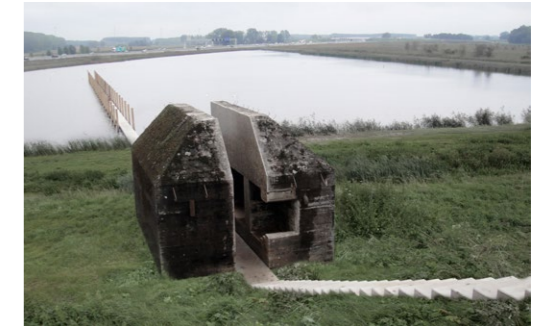
Bunker 599 New Dutch Waterline, 2013